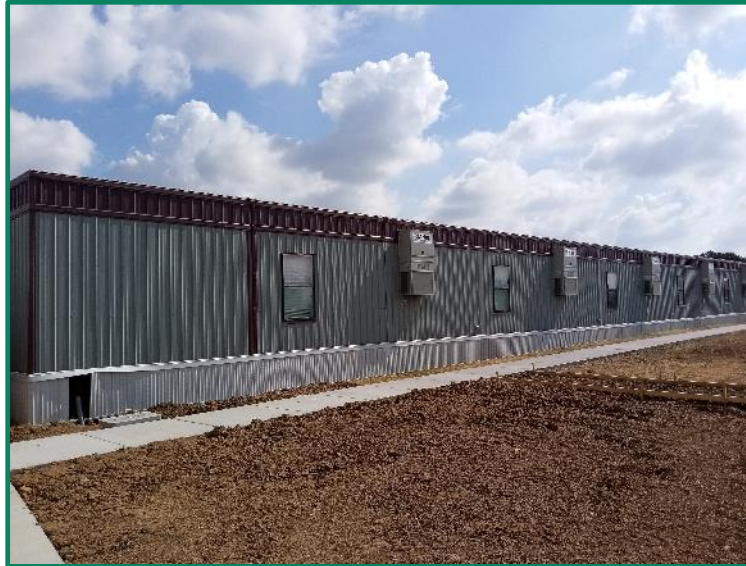
10 portable classrooms are complete