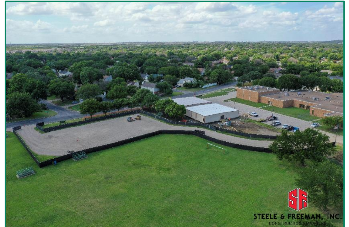
Temporary staff parking and bus loop

Site utility, pier drilling, grading, and portable connections are being made at Parkview ES. Temporary bus loop and staff parking lot is complete.