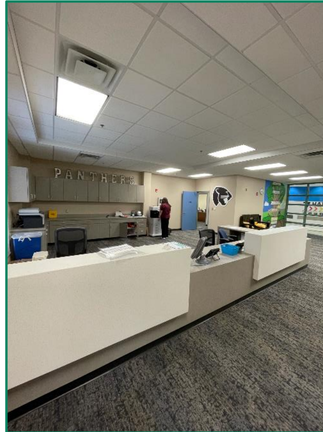
North Riverside ES