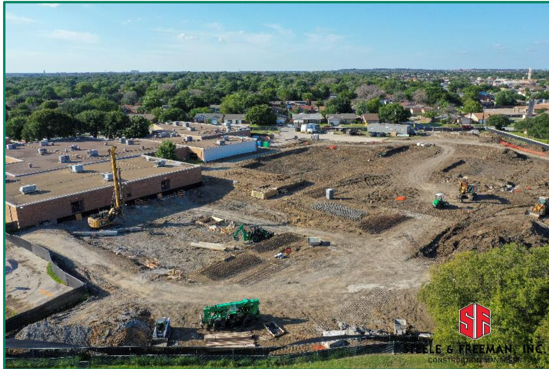
Pier drilling, site grading & temporary Fire Wall