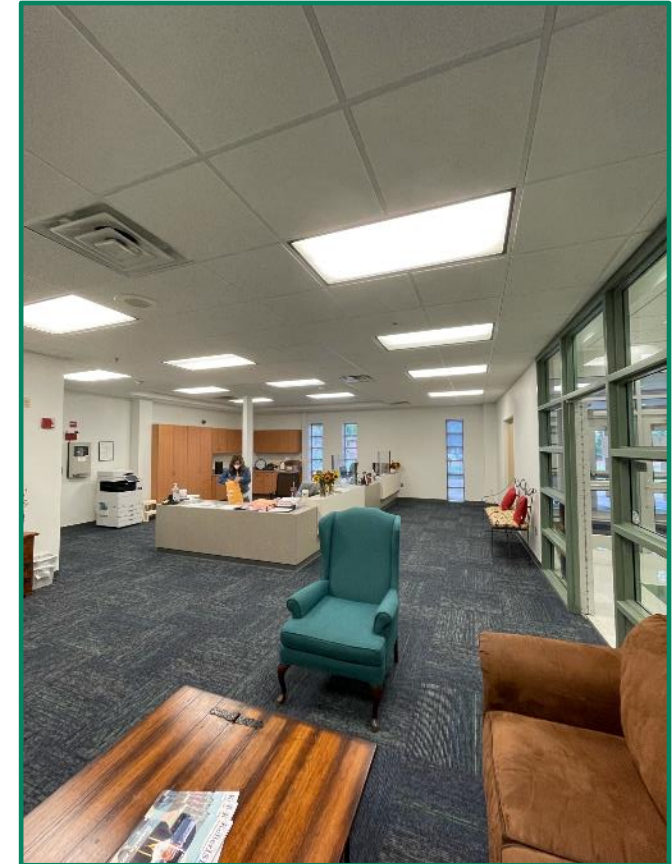
Willis Lane ES