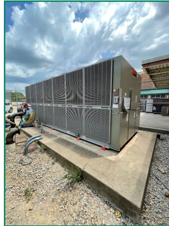
New Chiller for KCAL