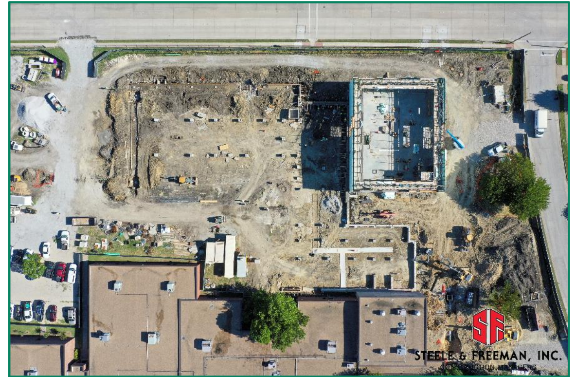
Grade beams and piers progress

Piers are complete, the foundation for the storm shelter is in place, storm shelter ICF walls, site grading, and utility connections are all in progress.