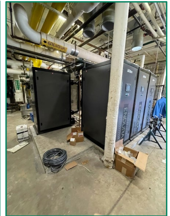
Hydronic Boiler Replacement for KHS