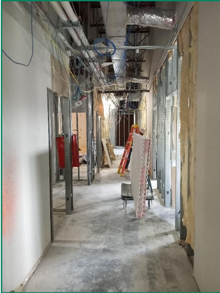
KCA construction progress

Tegrity has started the interior renovations at the Keller Collegiate Academy (KCA) and should be complete within 6-8 weeks.