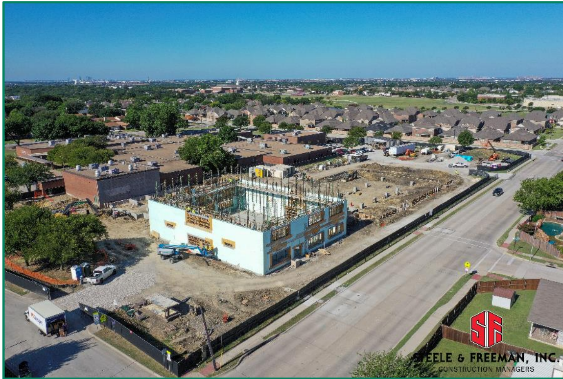
Storm Shelter Insulated Concrete Form (ICF) Progress