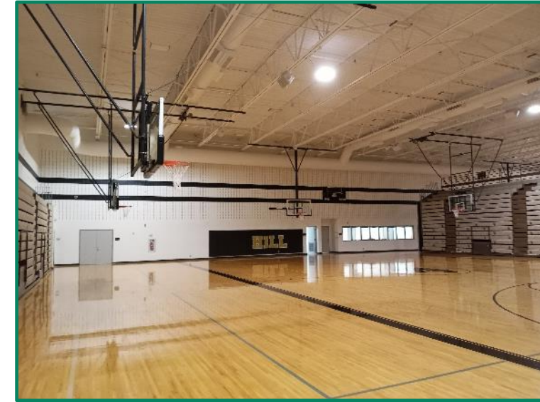
Locker room and gym progress

Site grading, utilities, concrete are in progress